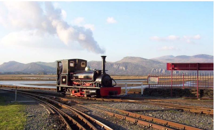
1891 Hunslet Lilla shunts at Boston Lodge on the Ffestiniog Railway following the successful annual steam test on 19th Feb 2004, in which the photographer's volunteer skills had been instrumental.