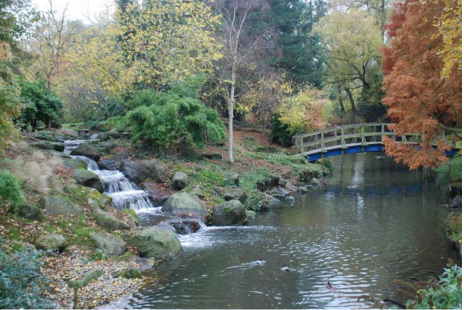
Autumn colours glow in these trees reflected in an ornamental lake in Regent's Park.

On our walk back to catch our bus home we called at No. 221b Baker Street where, according to the stories by Sir Arthur Conan Doyle, Sherlock Holmes and Dr. Watson lived 1881–1904. Now claimed to be the world's most famous address, it houses the Sherlock Holmes museum. I have to admit that we only spent a short time in the gift shop, bought nothing, and didn't visit the museum.