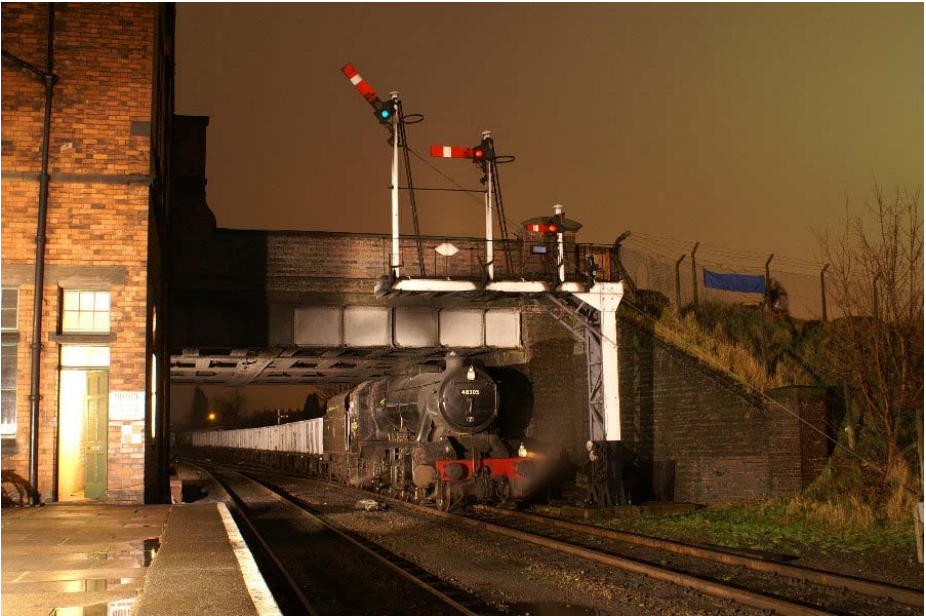
8F 48305 entering Loughrough Central station, Great Central Railway, during a night photographic evening, 16th Jan 2007. The Up line is clear for a 7F passing south.