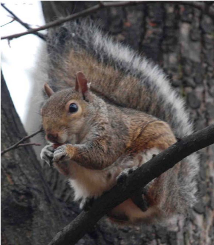
This squirrel tucks in to a nut taken from the hand of a passer by in Regent's Park