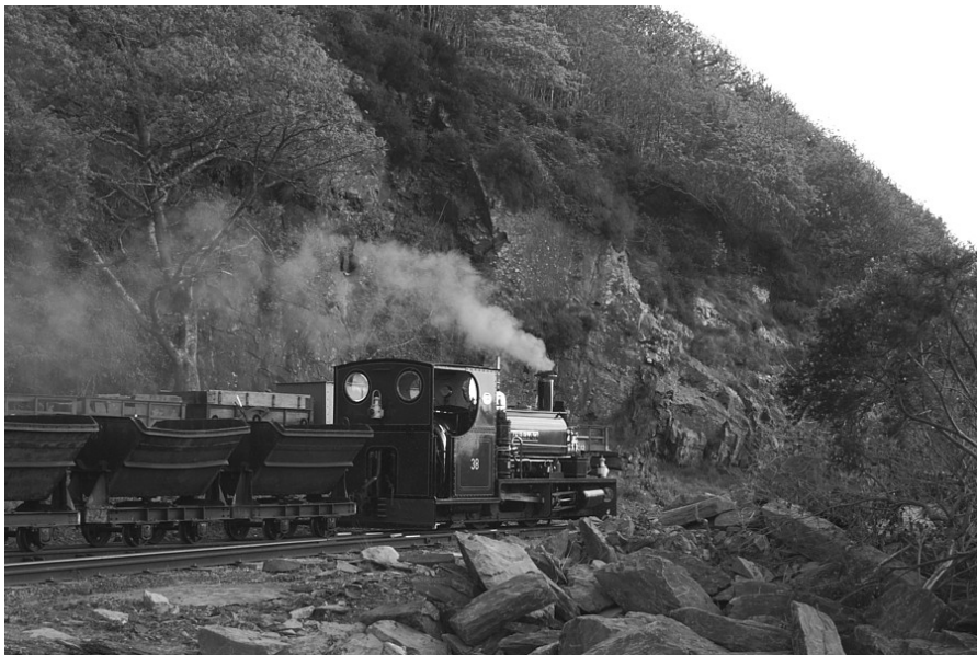
Hollycombe Steam Collections Jerry M, an 1895 Hunslet, in Boston Lodge, Glan Y Mor yard, passing off as a quarry on a photographic charter train during its visit to the Ffestiniog Railway, May 2008